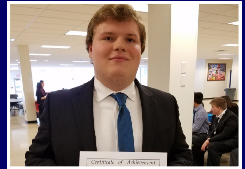
Degree of Superior Distinction Pin