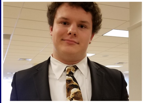
Degree of Special Distinction Pin